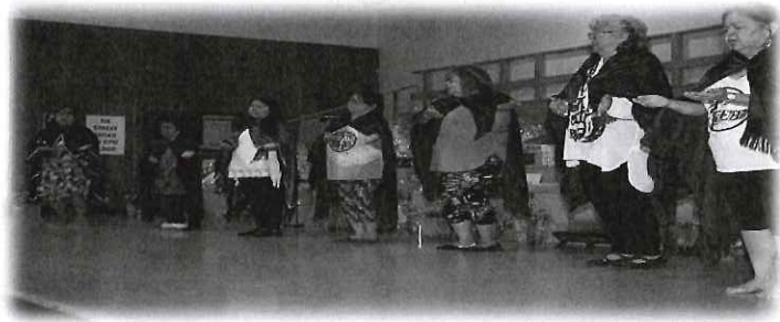
Tseshiht hosts Island Elders Luncheon