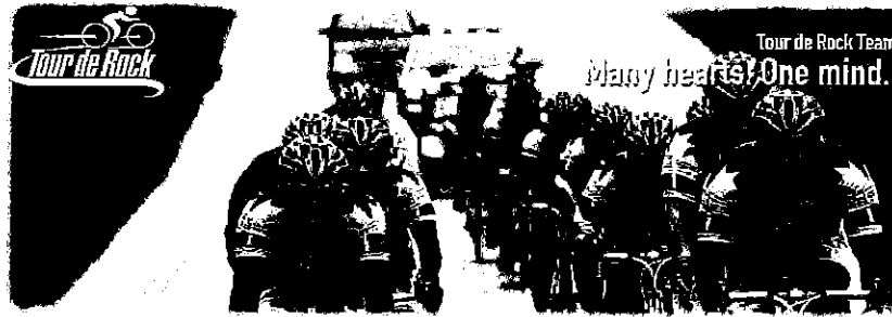
Tour de Rock: Many hearts. One mind.