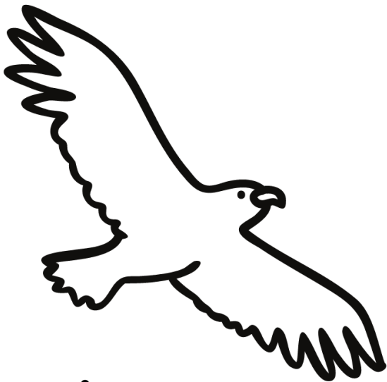
čix w atin